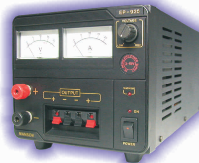
EP - 925

The current of the unit is depended on the output voltage as the following curve.